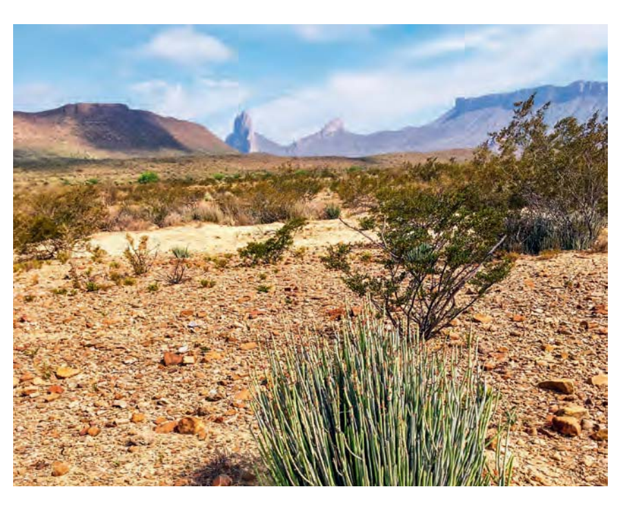
{ m L'Or\'eal} and its candelilla wax supplier have been conducting a programme since 2016 that allows to improve the living conditions of 165 {\it Candelilleros} – the local candelilla wax producers – while preserving the resource and its fragile ecosystem of the Chihuahua desert.

L'Orèal and Multiceras, its Monterreybased candelilla wax supplier have been conducting a programme since 2016 that allows to improve the living